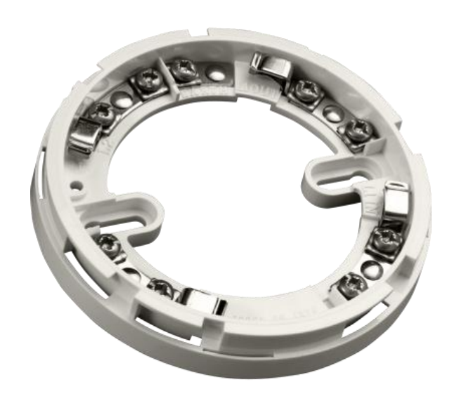
Part N. 2000-100

All detectors in the Series 27 range fit into Series 27 standard mounting bases. The bases are of 100mm diameter and have five terminals marked according to their function: Line 1 in, line 1 out, line 2 in and out, remote indicator negative, earth. Detectors are polarity insensitive, so that identification of positive and negative lines is only required if a remote LED is fitted. An earth connection is not required for either safety or correct operation of detectors. The earth terminal is provided for tidy termination of earthed conductors or cable screens and to maintain earth continuity where necessary. Bases have a wide interior diameter for ease of access o cables and terminals and there are two slots for fixing screws at a spacing of 51 to 69mm. Detectors fit into bases one way only and require clockwise rotation without push force to be plugged in. They can be locked into the base by a grub screw using a 1.5mm hexagonal driver.